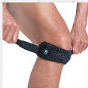
KB224 Double-Pull Patella Tendon Support with Pad Neoprene, Nylon, Spandex, Bamboo charcoal yarn, EVA, PE Size : universal