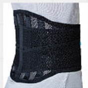
LB223 Adjustable 10" Breathable Lumbar Support Polyester, Nylon, Rubber, Polypropylene, Steel Size : S / M / L / XL