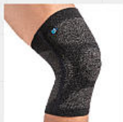
KD321 Dr. Care Knee Support with Straps Polyester, Lycra Spandex, Nylon Size : S / M / L / XL