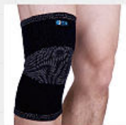
KB120 4-Way Elastic Knee Support Latex, Nylon, Bamboo charcoal yarn, Spandex Size : S / M / L / XL