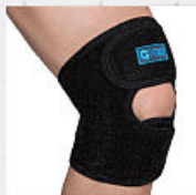
KB222 Adjustable Knee Support with Support Stays Neoprene, Polyester, Nylon, Bamboo charcoal Size : universal