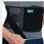
LB221 Adjustable 6" Lumbar Support with Efortless Design Polyester, Nylon, Rubber, Polypropylene, Steel, Bamboo charcoal yarn Size : S / M / L / XL