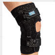
KP420 Hinged Knee Brace Polyester, Spandex, Nylon, Polyvinyl chloride, Neoprene, Metal Size : S / M / L / XL