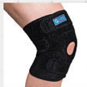
KB221 Adjustable Knee Support with Patella Support Neoprene, Polyester, Nylon, Bamboo charcoal Size : universal