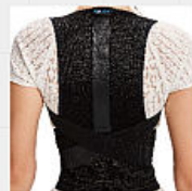
LB224 Adjustable Posture Corrector Nylon, Polyester, Rubber Size : XS / S / M / L