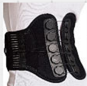
LH220 easyfit™ Lumbar Support with pulley system Polyester, Nylon, PE, Rubber, POM, Cotton Size : S / M / L