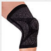
KD322 Dr. Care Pro Knee Support with Gel Pad Polyester, Lycra Spandex, Nylon Size : S / M / L / XL