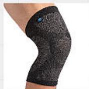
KD320 Dr. Care Knee Support Polyester, Lycra Spandex, Nylon Size : S / M / L / XL