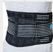
LB222 Adjustable 6" Lumbar Support Polyester, Nylon, Rubber, Polypropylene, Bamboo charcoal yarn Size : S / M / L / XL