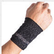
WD320 Dr. Care Wrist Support Polyester, Lycra Spandex, Nylon Size : S / L