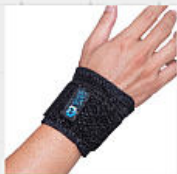
WB222 Adjustable Wrist Support with Support Wrap Neoprene, Polyester, Nylon, Bamboo charcoal Size : universal