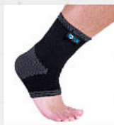
AB120 4-way Elastic Ankle Support Latex, Nylon, Bamboo charcoal yarn, Spandex Size : S / M / L / XL