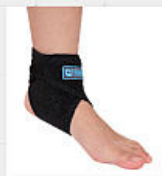
AB222 Adjustable Ankle Support Neoprene, Polyester, Nylon, Bamboo charcoal Size : universal