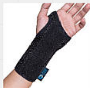
WS224 Adjustable Wrist Brace Polyester, Nylon, Rubber, Spandex Size : S / M / L