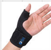
WS223 Adjustable Thumb Support with Splice Polyester, Nylon, Rubber, Spandex Size : S / M