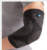
ED320 Dr. Care Elbow Support Polyester, Lycra Spandex, Nylon Size : S / L