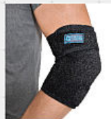
EB221 Adjustable Elbow Support with Adjustable Wrap Neoprene, Polyester, Nylon, Bamboo charcoal Size : universal