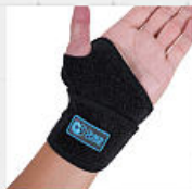
WB221 Adjustable Wrist Support with Ergonomic Compression Support Wrap Neoprene, Polyester, Nylon, Bamboo charcoal Size : universal