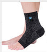
AD320 Dr. Care Ankle Support Polyester, Lycra Spandex, Nylon Size : S / L