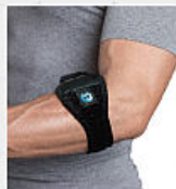
EB223 Tennis Elbow Brace with Gel Pad PU Form, Polyester, Nylon Size : universal