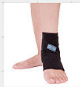
AB221 Adjustable Ankle Support with Adjustable Wrap Neoprene, Polyester, Nylon, Bamboo charcoal Size : universal