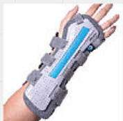
WH250 Wrist Brace with spiral stabilizer PC, Nylon , EVA, Spandex Size : Left/ Right