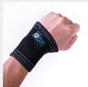
WB120 4-way Elastic Wrist Support Latex, Nylon, Bamboo charcoal yarn, Spandex Size : S / M / L / XL