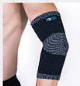
EB120 4-way Elastic Elbow Support Latex, Nylon, Bamboo charcoal yarn, Spandex Size : S / M / L / XL